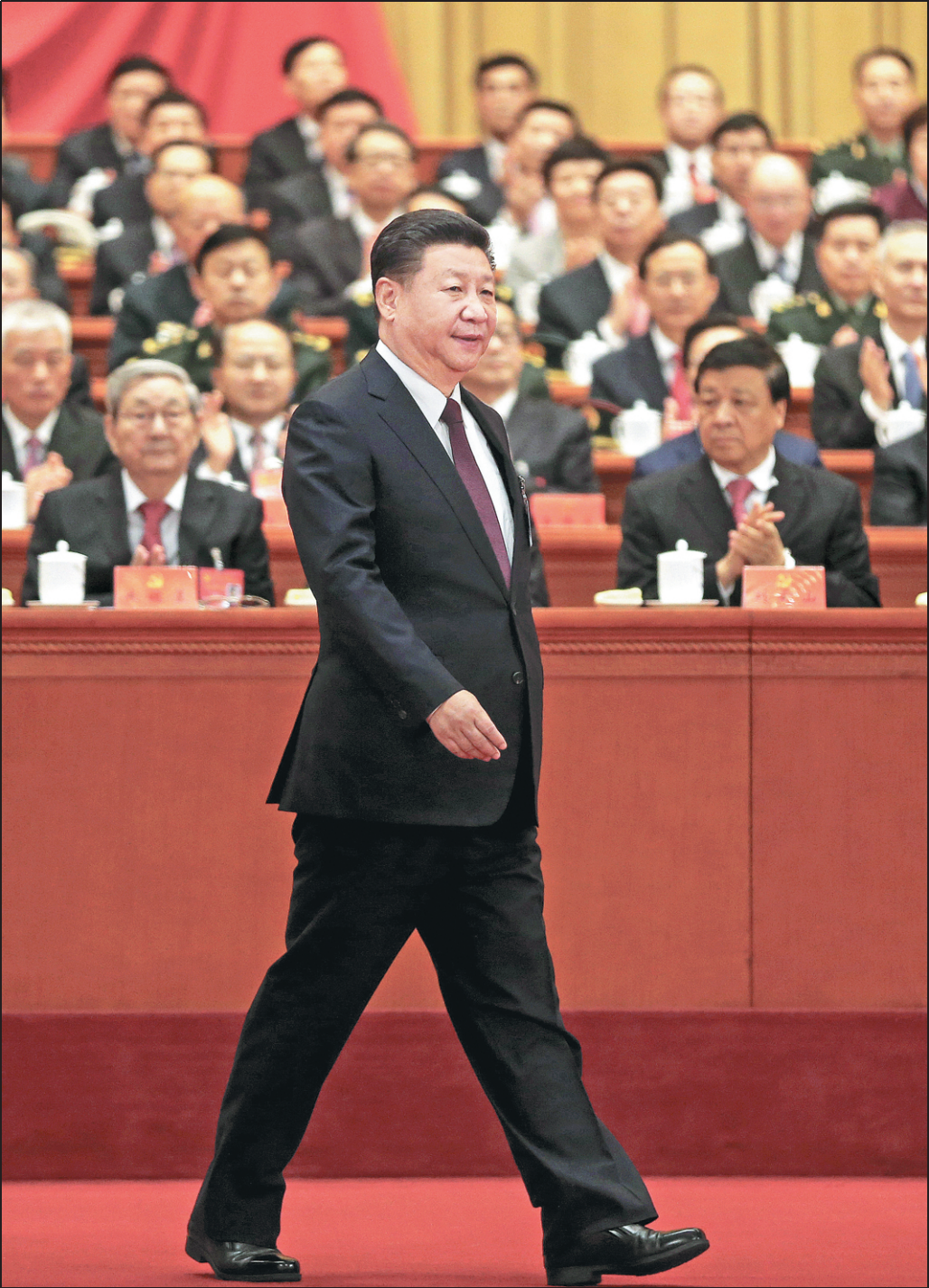
General Secretary Xi Jinping prepares to address the 19th National Congress of the Communist Party of China, which began on Wednesday in the Great Hall of the People in Beijing. Xi delivered a report on behalf of the CPC’s 18th Central Committee.